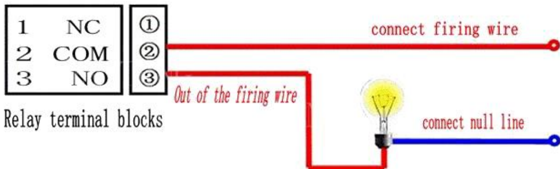
Relay connection diagram